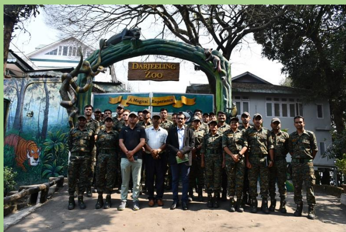
Educational visit of Madhya Pradesh Range Officer Trainees on 01.04.2025