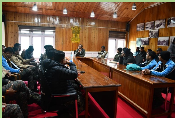
Educational visit of Chandrapur Forest Academy Trainees on 12.05.2025