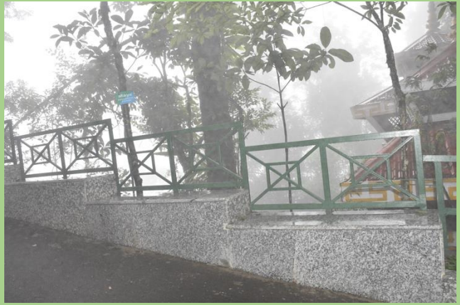
Development of seating arrangements of visitors in front of Red Panda enclosure at PNHZP