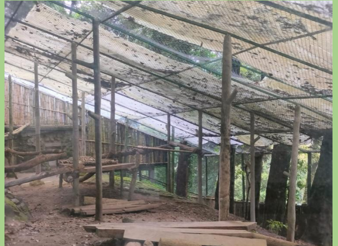
Re-construction of platform at Snow Leopard enclosure