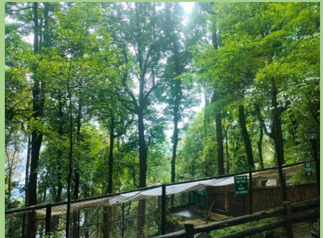
Pre-monsoon enrichments at Snow Leopard enclosure