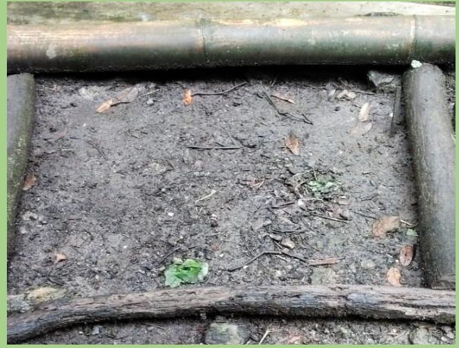
Installation of Sand bath at Pheasantry