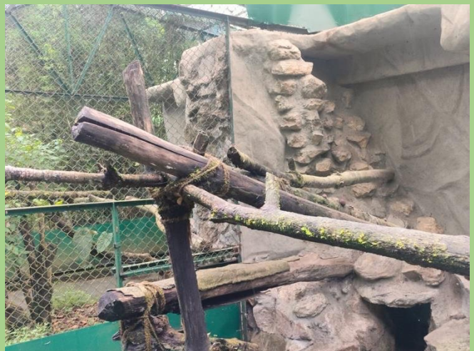
Aerial walkways at lesser carnivore enclosure