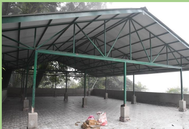
Vertical extension of existing staff quarter for construction of multipurpose hall