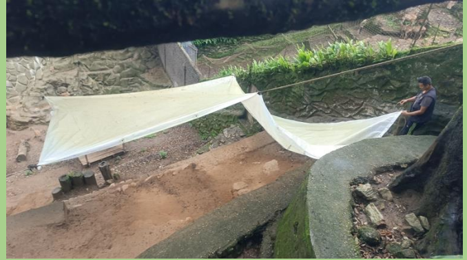
Pre-monsoon enrichments at herbivore enclosures