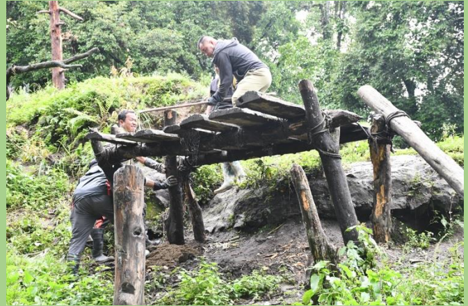
Re-construction of platform at Himalayan Black Bear