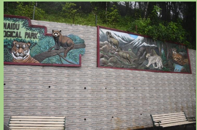
Providing weather protection tiles near main gate at PNHZP